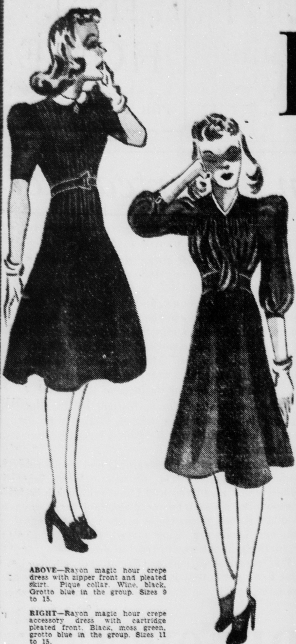
ABOVE—Rayon magic hour crepe dress with zipper front and pleated skirt. Pique collar. Wine, black, Grotto blue in the group. Sizes 9 to 15. RIGHT—Rayon magic hour crepe accessory dress with cartridge pleated front. Black, moss green, Grotto blue in the group. Sizes 11 to 15.

Saturday Is Dedicated to the Fashion Needs of the BUSINESS WOMAN!