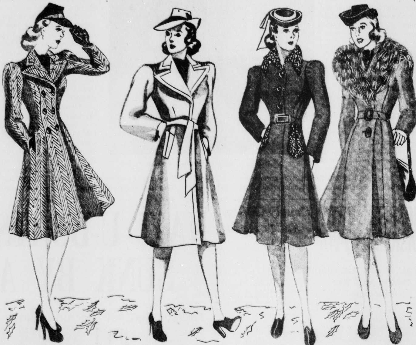
Double Breasted Tweed Sport Coat