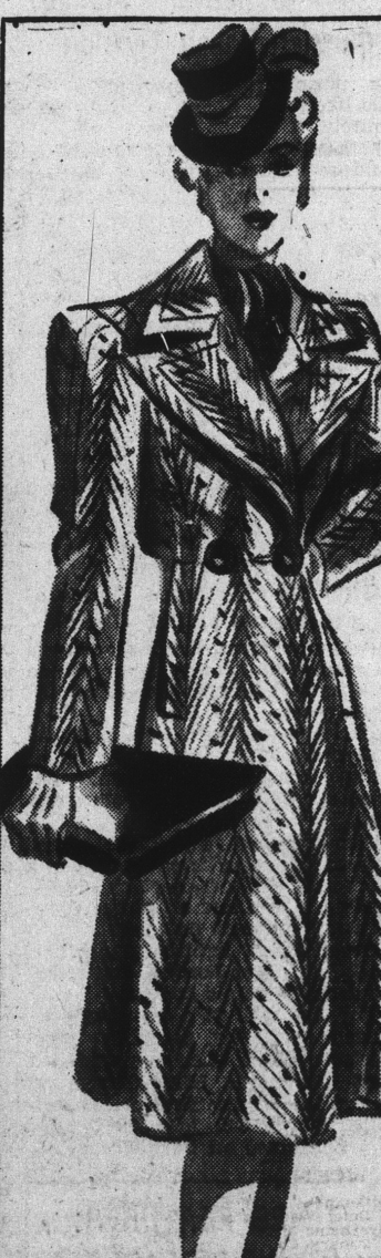
Herringbone Tweed Coat

Silver Fox rump trimmed coat with kidney collar. Box style of striped frieze fabric, black only. Size 19 . . . . . $38.00