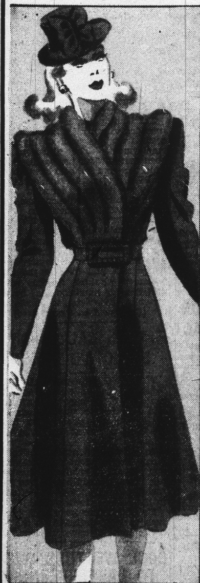
Kolinsky Trimmed Botany's Fabric Coat

Botany's twill fabric coat in fitted style. Kolinsky trimmed in plastron front, green and black. Size 14 . . . . . $38.00