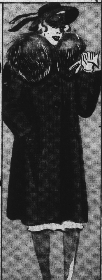
Silver Fox Trimmed Fabric Coat

"Gibson Girl" fitted coat of striped frieze fabric, in black only. Size 18 . . . . . $16.95