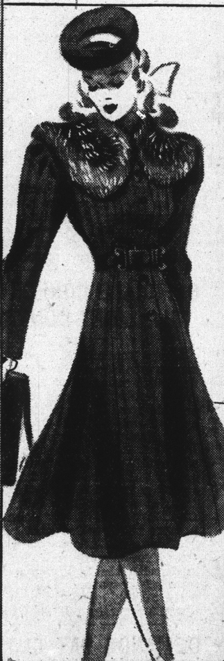
Silvered Fox Trimmed Onde' Fabric Coat

Botany's twill fabric coat in fitted style. Kolinsky trimmed in plastron front, green and black. Size 14 . . . . . $38.00