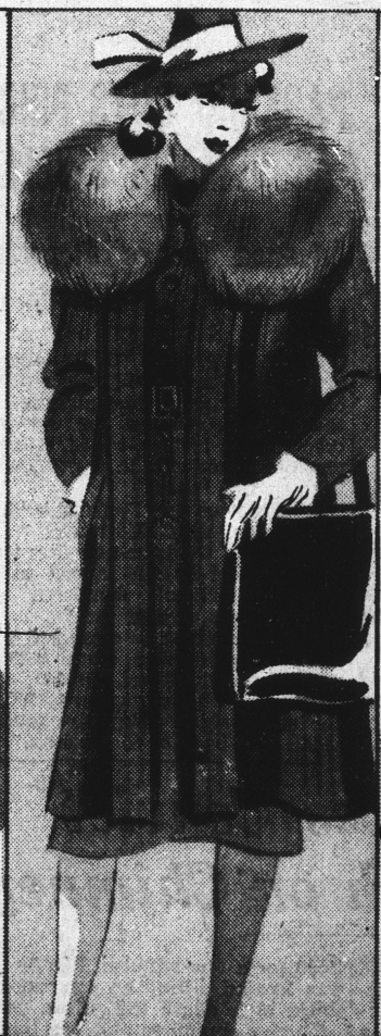
Wolf Trim 3-Pc. Wardrobe Suit

Silvered Fox trimmed fitted coat with sailor collar. Striped Onde' weave fabric in black. Size 13 . . . . . $28.00