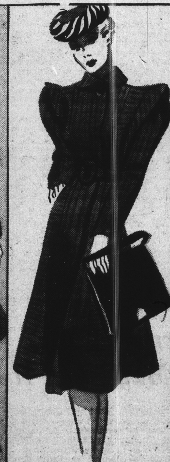
"Gibson Girl" Fitted Coat

Full Persian Lamb collar and pockets. Durable Botany's neeplepoint fabric. Black only. Size 37 . . . . . $38.00