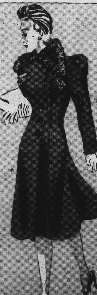
Persian Trimmed "Bobby Burns" Coat

Onde' weave double twill fabric coat with grey squirrel plastron collar. Wine and black. Size 9 . . . . . $28.00