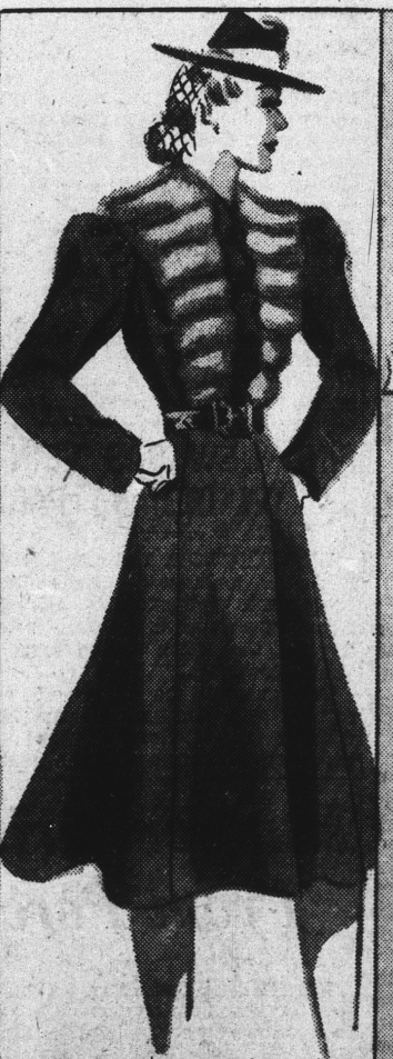
Grey Squirrel Trimmed Coat

Three-piece wardrobe suit consisting of Cardigan jacket and skirt to match and outer coat with wolf trimmed kidney collar. Julliard's fabric. In black and wine. Sizes 14 to 18 . . . $25.00