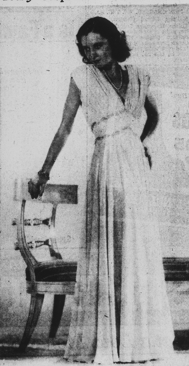
A bit of Grecian glamour is this ivory crepe evening gown in simple classic lines. Laurel leaf garlands of silver bugle beads outline the fitted yoke. Barbara Stanwyck, Hollywood actress, wears a bracelet of leaves in rubies and diamonds with the gown.