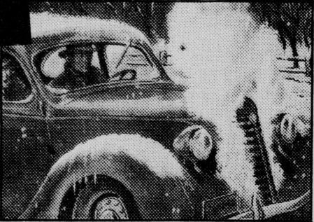
Anti-freeze that boils away on warm days leaves you unprotected for the next cold wave.

COSTS MORE BY THE GALLON... LESS BY THE WINTER