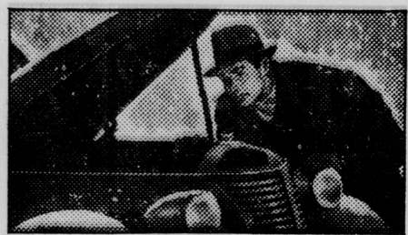
Get out of the "Worry Class" this winter. Once you put in "Prestone" anti-freeze, there's NO MORE GUESSING!

Don't Fail to See Our Large Selection of FUR COATS Priced From $49.50 All on Easy Terms