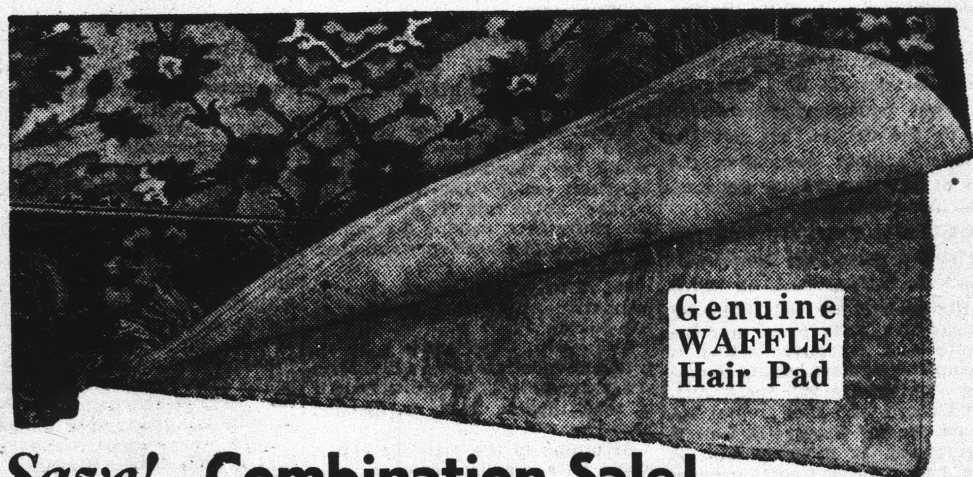
Genuine WAFFLE Hair Pad