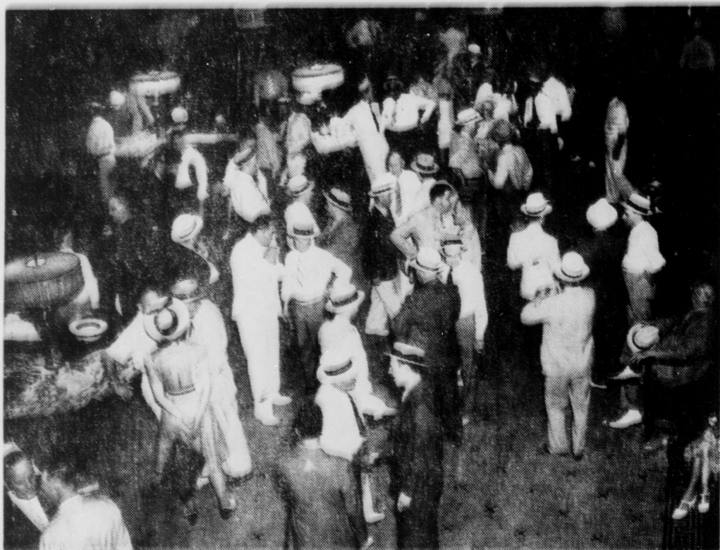
Hundreds of Democratic party workers milled through the Claypool Hotel lobby after the big conclave got into full swing last night. Today they assembled at the Fair Grounds Coliseum.