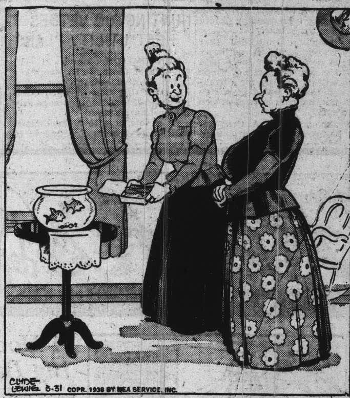
"I never scold them—I just let these sardines remind them what happens to naughty fish!"