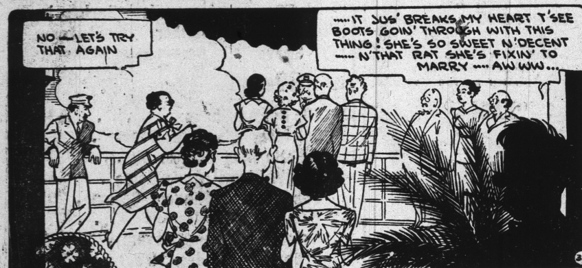
LITTLE MARY MIXUP