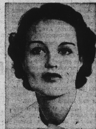
Rochelle Hudson, youthful veteran of six cinema years, will be one of Kate Smith's guests on her 7 o'clock CBS-WFPM hour tonight. Another visitor will be the noted swing virtuoso of the vibraphone, Adrian Rollini.

High School Orchestra and College Choir on NBC Red Network.