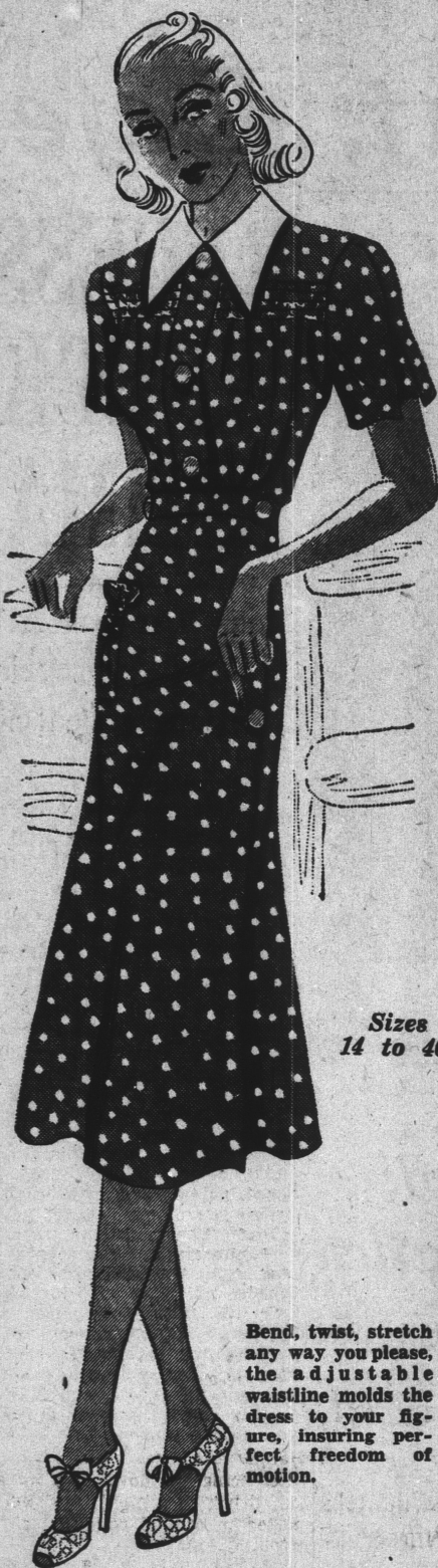
Sizes 14 to 46!

Bend, twist, stretch any way you please, the adjustable waistline molds the dress to your figure, insuring perfect freedom of motion.