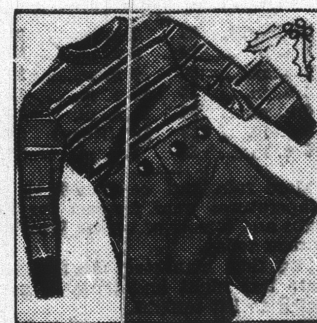
Boys' 2-Piece Gift Suits

Made of durable fast-color fabrics. Smart styles attractively trimmed. Many zipper front styles. Sizes 7 to 16 years.