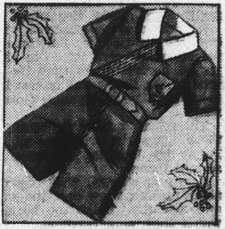
Boys' Wash Suits

Beacon cloth baby buntings, full length zipper with detachable hood. Satin ribbon trim. White, pink and blue.