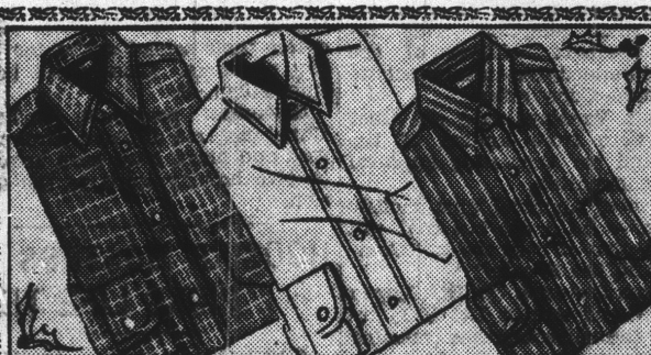
BOYS' GIFT SHIRTS

2-Pc. cotton Jersey suits for boys. Striped polo shirt with lined shorts. Brown, wine and blue. Sizes 3 to 6 years.