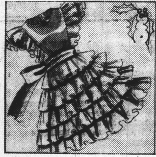
Girls' Rayon Taffeta Frocks

Girls' raincoats of waterproof fabric. Hood attached style. Navy, red, brown and gay color plaids.