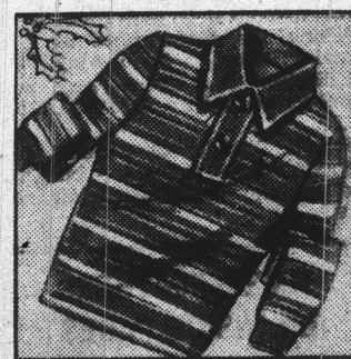
Boys' Cotton Jersey Polo Shirts

Infants' 3-piece wool bootie sets, including hand crochet sacque, cap and booties. White, pink and blue.