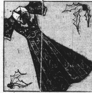
Girls' Spun Rayon Frocks

Washable rayon taffeta party dresses for girls 7 to 14 years. Full skirt, ruffle and straight line styles. Pastel colors.