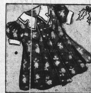
Tots' Rayon French Crepe Dresses

Novelty print aprons for tots. Gay, colorful prints. Fast colors. Sizes 2 to 6 years.