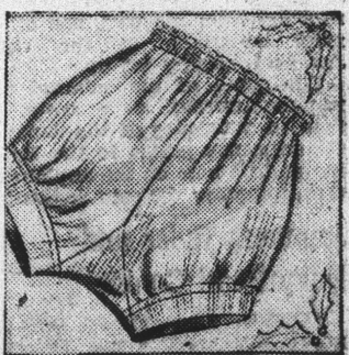
Tots' Non-Run Rayon Panties

Boy's cotton Jersey polo shirts. Novelty stripes on deep-tone backgrounds. Blue, brown, wine. Sizes 3 to 6 years.