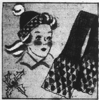
Girls' Scarf Sets

Infants' genuine wool angora bonnets, satin ribbon trimmed. Dainty pastel colors. An unusual value.