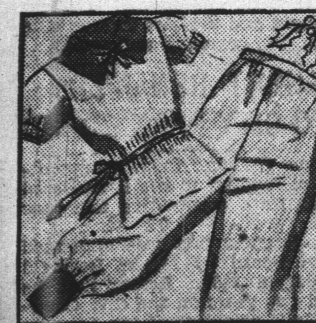
Children's Tuckstitch Pajamas

Button-on and belted style wash suits in deep tones of wine, blue and brown, with contrasting blouses. Sizes 1 to 6 years.