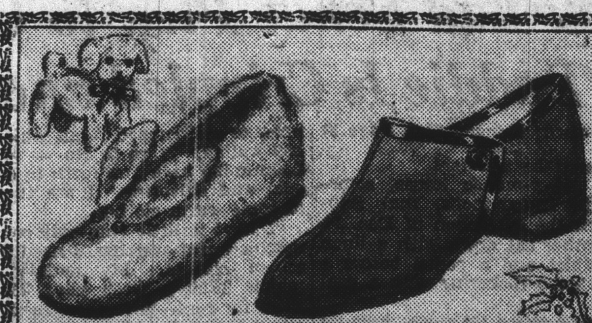
TOTS' GIFT SLIPPERS

Lovely French crepe rayon dresses in attractive styles. Novelty prints. Contrasting trims. Sizes 3 to 6 years.