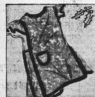
Tots' Print Gift Aprons

2-Pc. tuckstitch pajamas. Novelty trimmed styles. Dainty pastel shades. Sizes 6 to 16 years.