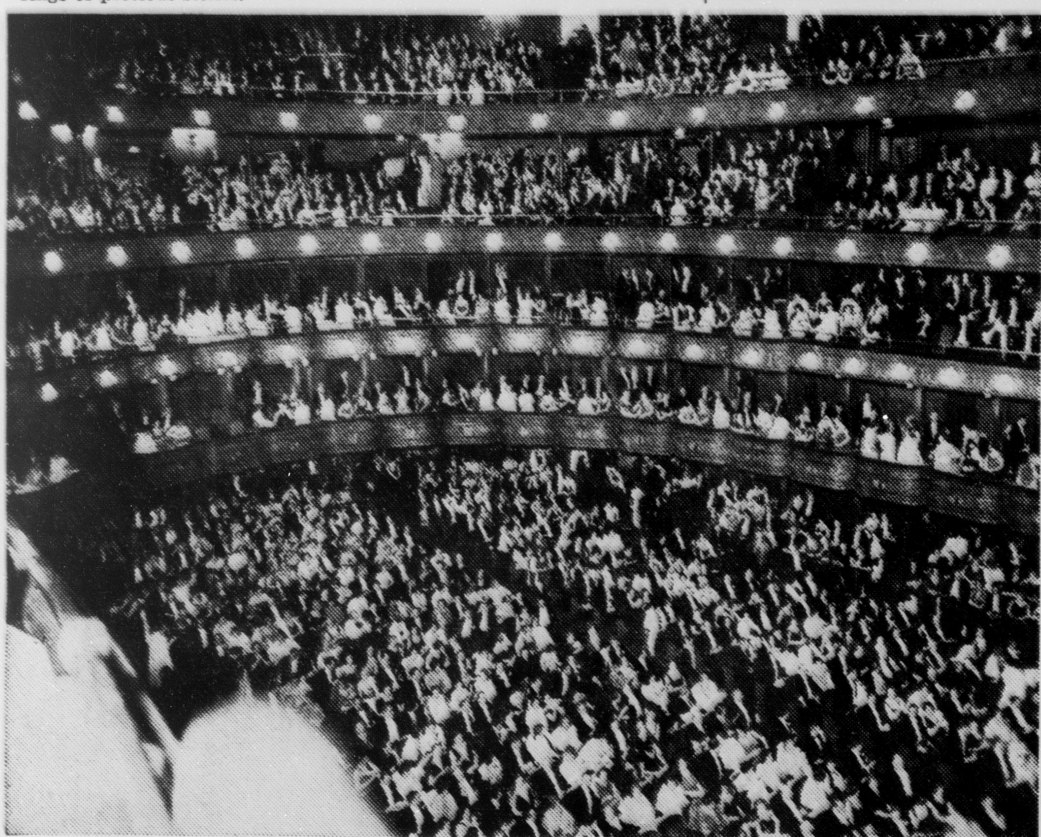
Above is a general view of the diamond horseshoe in the Metropolitan Opera House, as society turned out in all the splendor of its jewels and ermine to hear Kirsten Flagstad and Lauritz Melchior sing the title roles of "Tristan and Isolde" at the opening of the opera company's 53d regular season.

3 Pcs. Reg. $1 Vogue Crepe HOSIERY $2.67 Complete with $1 Gift Chest NISLEY'S 44 N. Pennsylvania St.