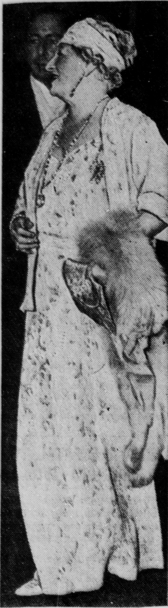
Diamonds, diamonds, diamonds is the inventory of Mrs. Cornelius Vanderbilt's ornaments, including a necklace, earrings, bracelet, rings and brooches. Her gown is flesh and silver lame.