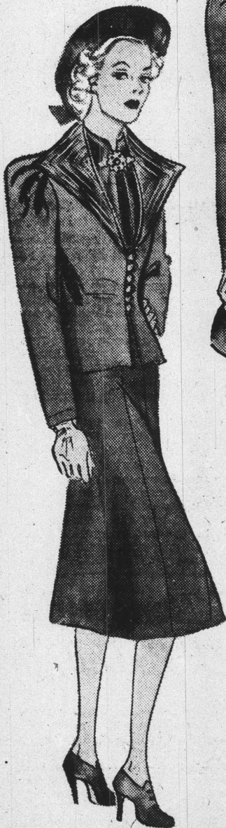
Above—The wool suit type dress that'll give you that "million dollar look." This has a modified air of simplicity with its almost straight lines. Trimmed with Persian fur fabric. Size 16 at $16.75