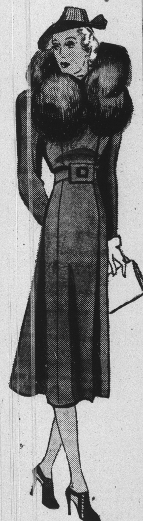
Below—Another all-time favorite is this brown nubby wool with its collar of Sable Dyed Fitch. A new 1937 style because of its slim and molded lines. A size 16 at ..... $38