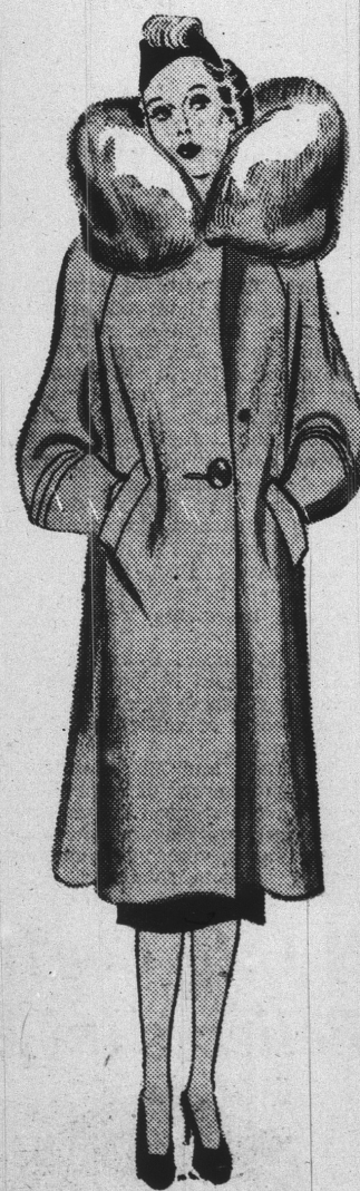
Above—Another version of the slim and molded silhouette with softer rounded shoulder and collar treatment. This is a "Caracuna" coat in green, trimmed with a lovely Silvered Fox collar. Size 15 at ..... $38