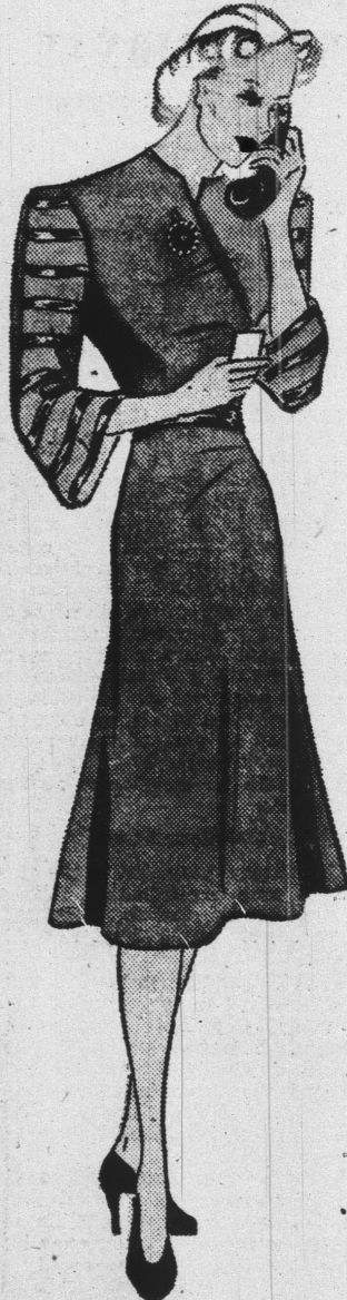
Above—A dressy afternoon dress in black alpaca in the pencil silhouette. The plain satin braiding on sleeves and simple button clip at neck give this dress the air of smart simplicity. Size 13 at ..... $10.75