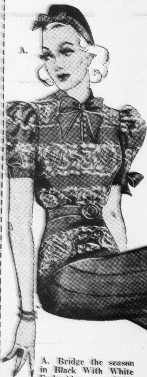
A. Bridge the season in Black With White Embroidery $6.98

Downstairs at Ayres Where Correct Fashions Are Less Expensive.