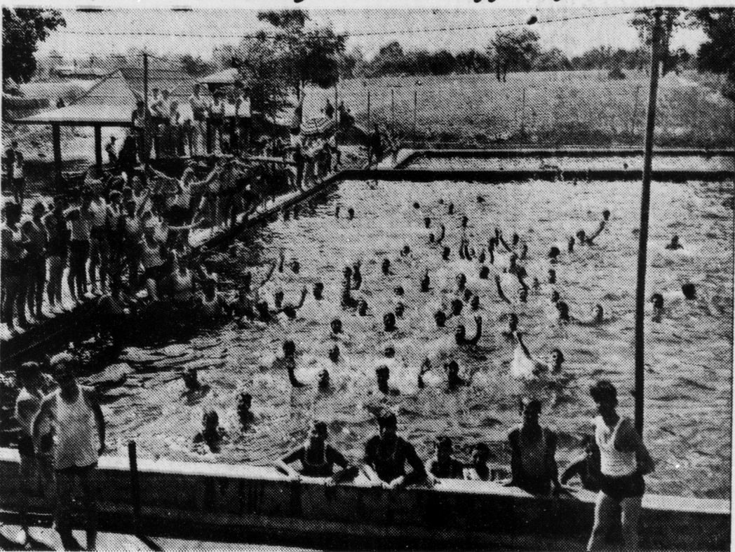
It's not all drilling and training for the 2000 boys attending the second C. M. T. C. encampment at Ft. Benjamin Harrison. Here are some of them enjoying a cooling splash in the big pool on the boy Scout Reservation.