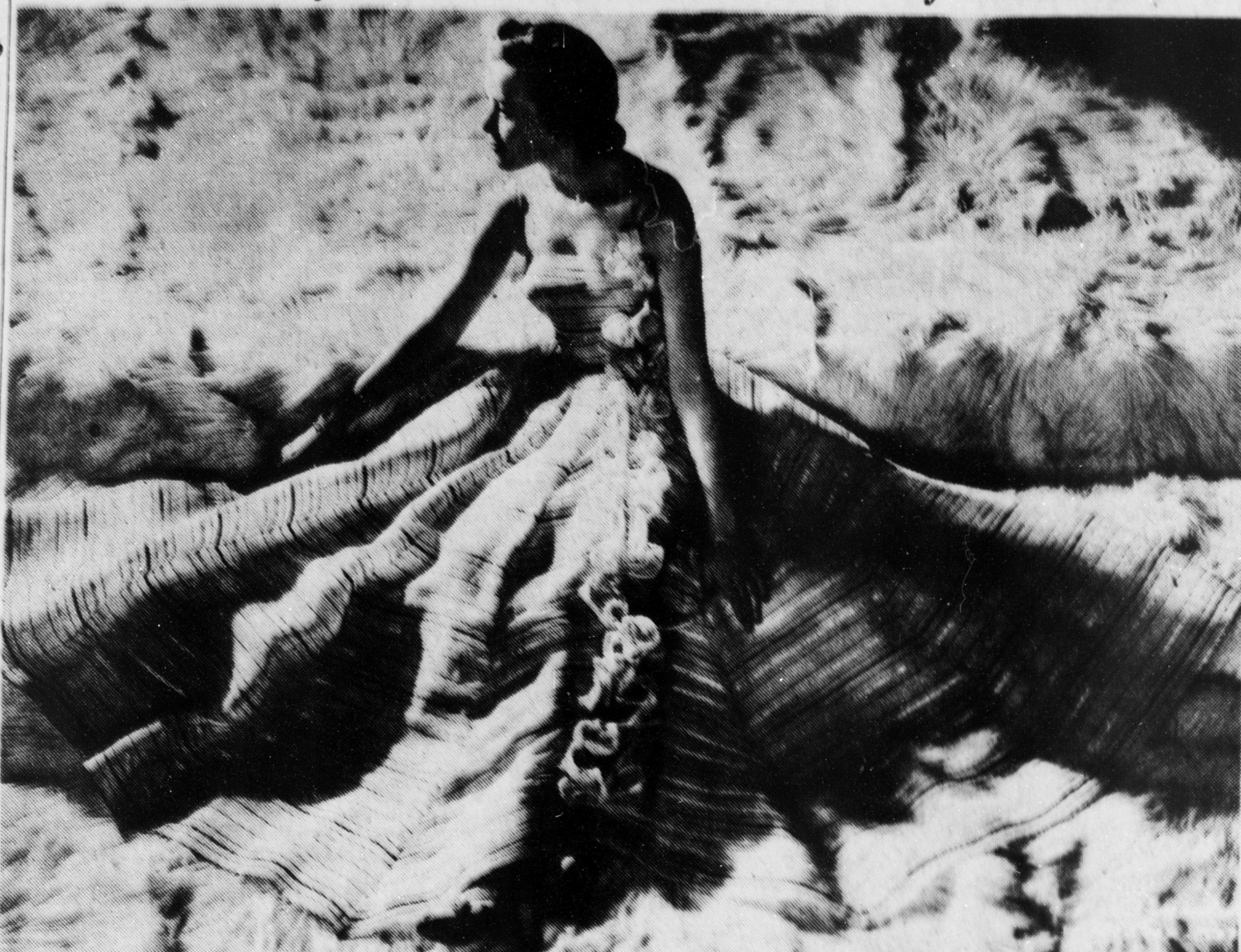
A "dream of a dress" are well-merited words when applied to this gown. Ruth Martin, well-known model, wears it in the "Vogues of 1938." It is styled with voluminous ankle-length skirt, with jagged

hemline and camisole bodice outlined with fluffy bows dropping from the décolleté to the hemline. The fabric is a pale blue organza striped in silver mauve and darker blue.