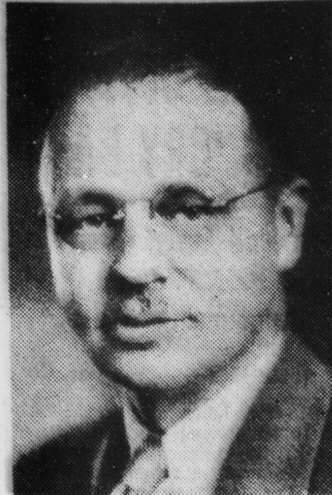
Times Special LAFAYETTE, July 12.—Dr.