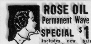
ROSE OIL Permanent Wave SPECIAL $1 Includes new hair cut, oil shampoo, finger wave and rinse. They are new, different, beautiful and lasting. Try one! No Appointment Needed.

Turkey Run lead in attendance with 47,363 visitors. The Dunes,