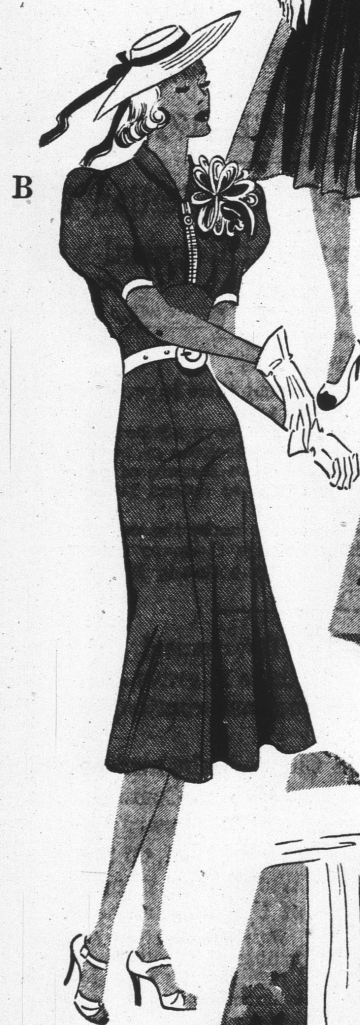
(B) Above— Sheer Navy Crepe Touched Off With White $3.98

The perfect dress for afternoons or evenings when you really want to make an impression. White ground with colorful, gay print pattern. Size 17.