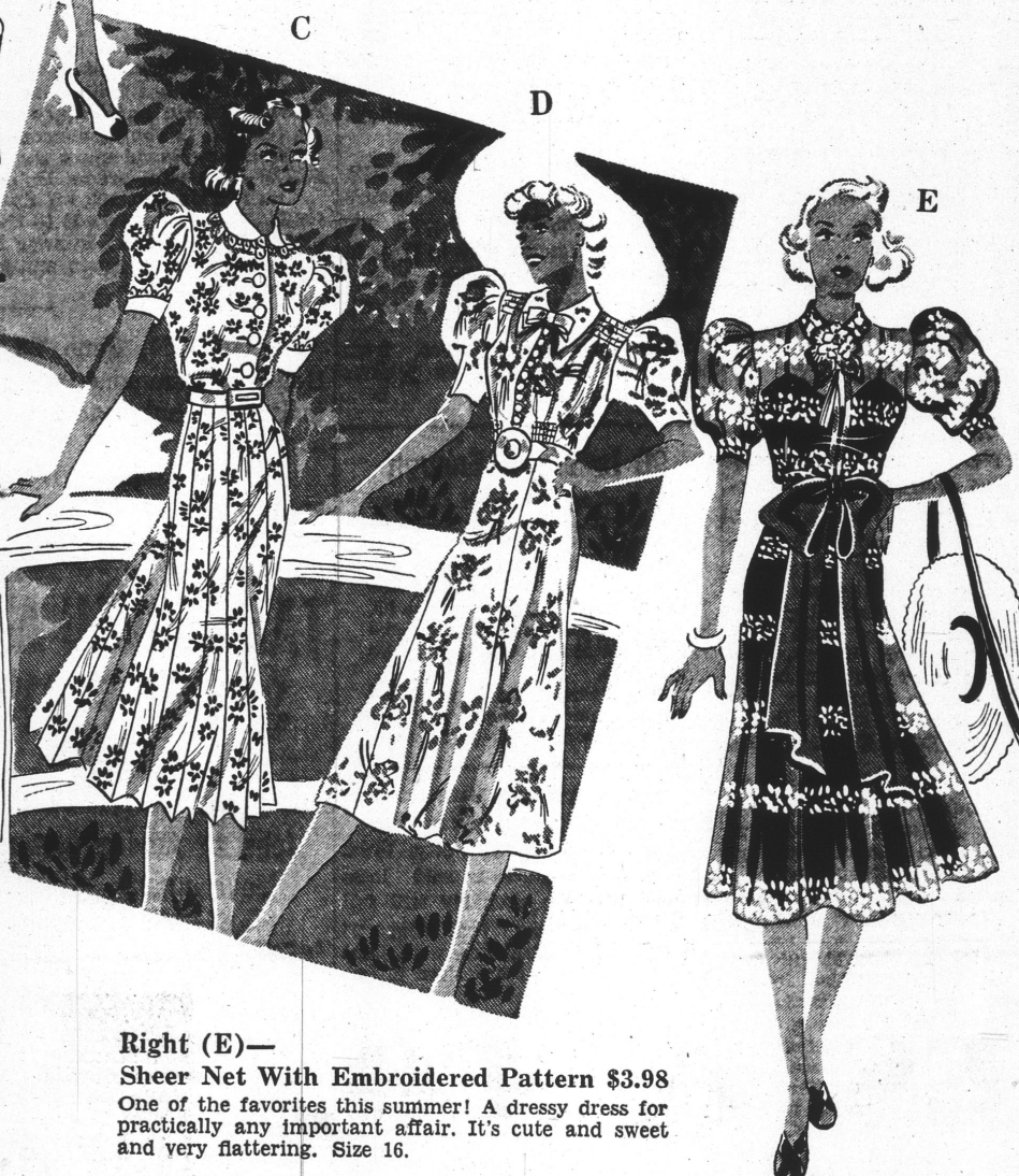
Right (E)— Sheer Net With Embroidered Pattern $3.98 One of the favorites this summer! A dressy dress for practically any important affair. It's cute and sweet and very flattering. Size 16.

A gem of a dress for traveling, vacations and even the office. It's sheer and cool. The neck has a zipper closing, and that's smart fashion. A size 11.