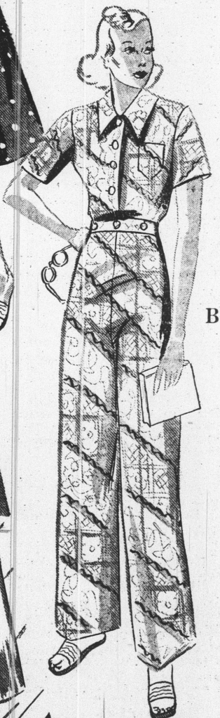
(B) Colorful Hawaiian Print Beach Pajamas $2.25

Cool, washable cotton 3-pc. play suit, for bicycling, tennis or beach. In gay print designs. Shirt and shorts with separate skirt. 14 to 20.