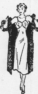
EASY To Take Off