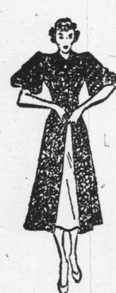
EASY To Put On