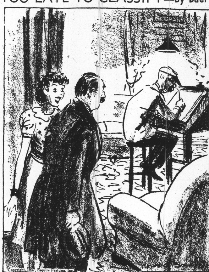
"He's an auditor I hired through a Times want ad to keep our household budget in shape."

Times Want Ads are sold by THE WORD. You do not pay for part of a line but ONLY for the number of words used. This arrangement makes Times Want Ads, more than ever, the economy Want Ads of Indianapolis.