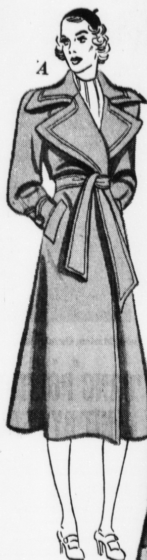
A. The Classic Wraparound $16.75

The practical California Wraparound in woolly fleece. Fully lined for warmth. In grey or tan. Size 16.