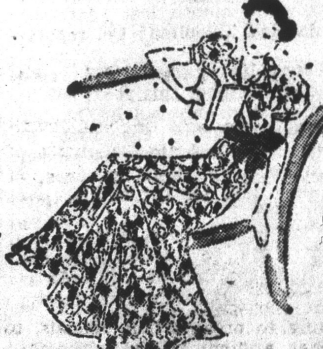
Wear it as a negligee for lounging around the house, choose one in every color.