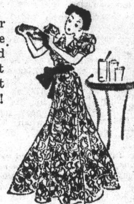
Wear it as a cocktail coat when guests drop in during the afternoon or evening!