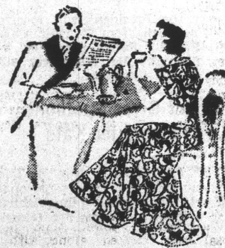
Wear it early in the morning while serving breakfast and look charming over the coffee cups!