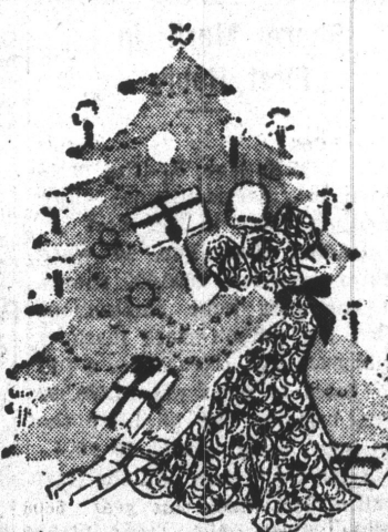
Buy them now in every color, for Christmas Gifts, even your best friends will never be able to tell what you paid for it!