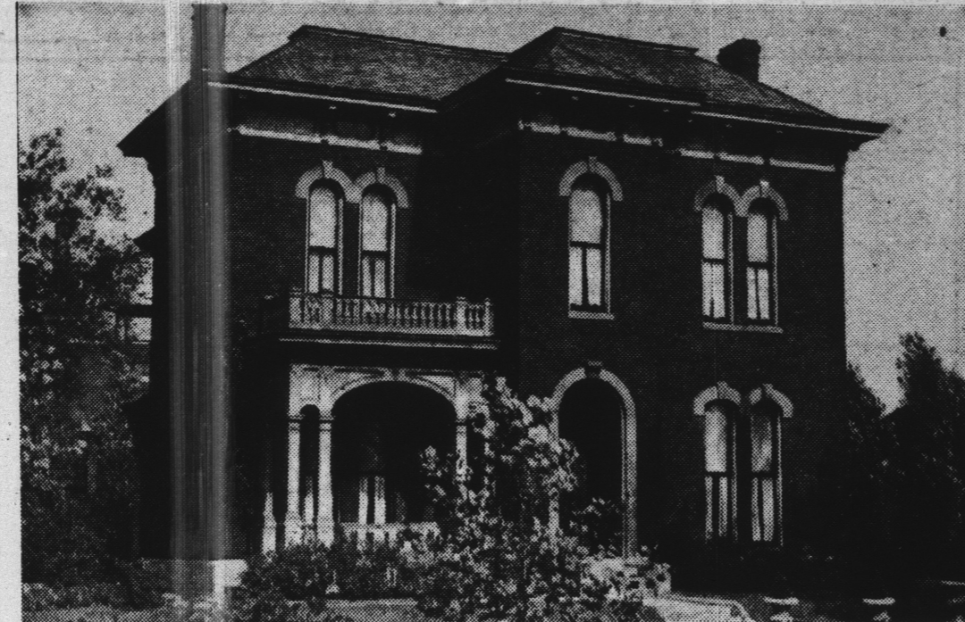
Indiana and the world today paid homage to James Whitcomb Riley, beloved Hoosier poet.