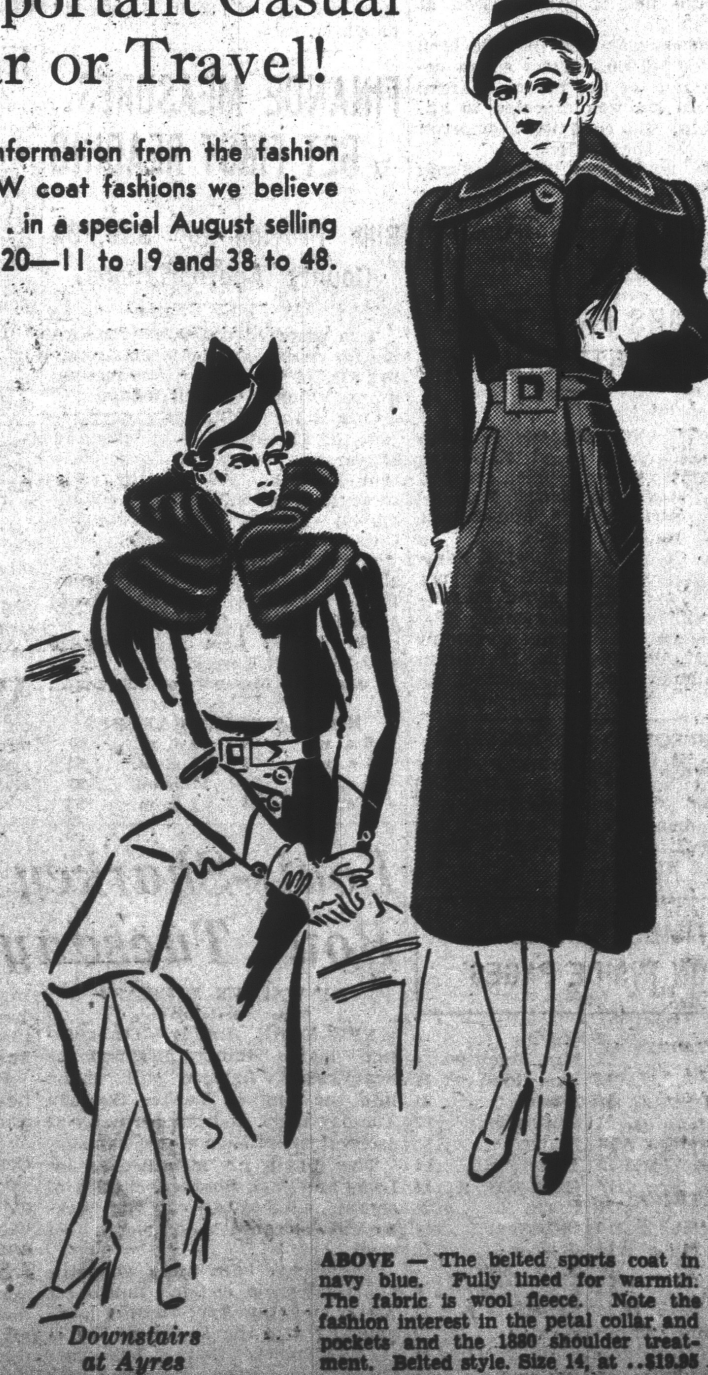
ABOVE—The belted sports coat in navy blue. Fully lined for warmth. The fabric is wool fleece. Note the fashion interest in the petal collar and pockets and the 1880 shoulder treatment. Belted style. Size 14, at $19.95