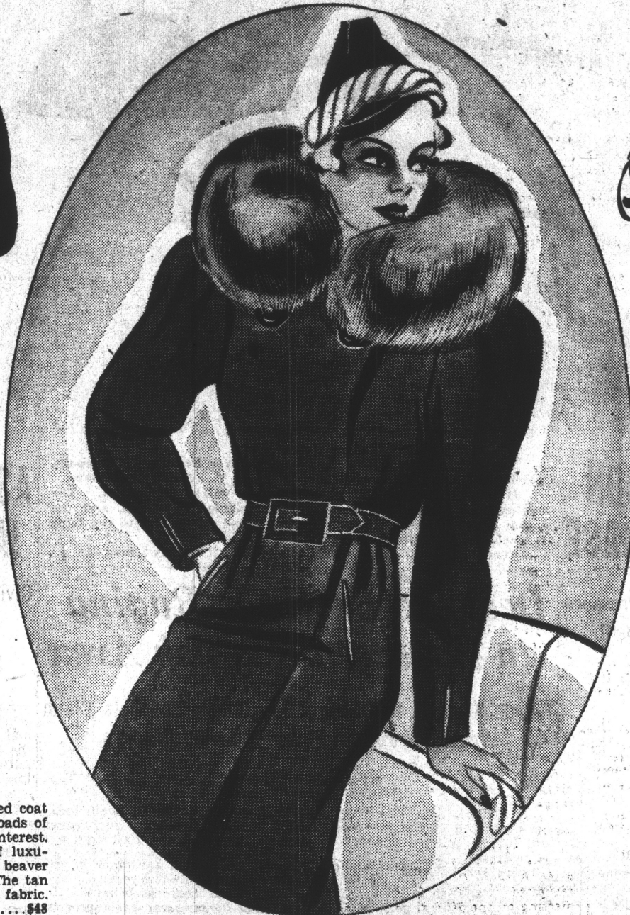
ABOVE—The semi-fitted coat with flared skirt and loads of sleeve and shoulder interest. The shawl collar is of luxurious, sleeky brown beaver with an ascot scarf. The tan check wool is a Stroock fabric. Size 14 .....$48