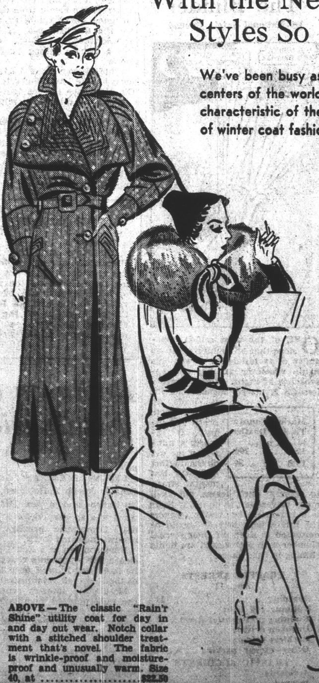
ABOVE—The classic "Rain's Shine" utility coat for day in and day out wear. Notch collar with a stitched shoulder treatment that's novel. The fabric is wrinkle-proof and moisture-proof and unusually warm. Size 40, at $32.50

RIGHT —Black dress coat of nubby surfaced wool fabric. The tunnel collar of marmink is fashion news, as is the 1880 shoulder interest. This coat can be worn with or without the belt. This is a size 13, at the advance price of $38