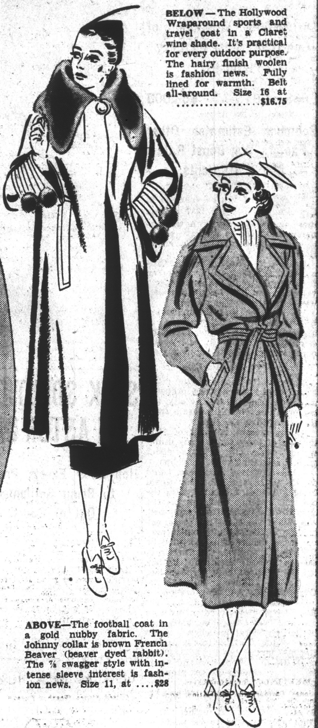
BELOW—The Hollywood Wraparound sports and travel coat in a Claret wine shade. It's practical for every outdoor purpose. The hairy finish woolen is fashion news. Fully lined for warmth. Bell all-around. Size 16 at $16.75