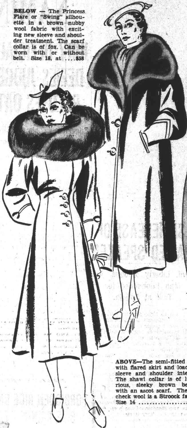
BELOW—The Princess Flare or "Swing" silhouette in a brown nubby wool fabric with exciting new sleeve and shoulder treatment. The scarf collar is of fox. Can be worn with or without belt. Size 18, at $38