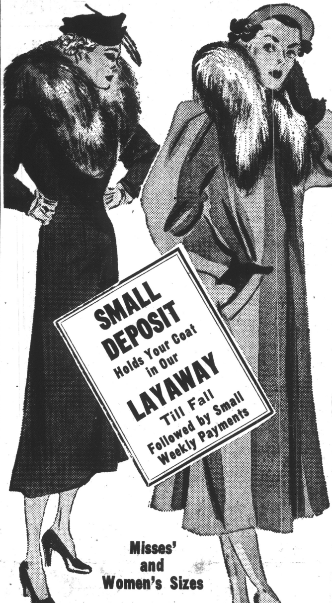
Misses' and Women's Sizes