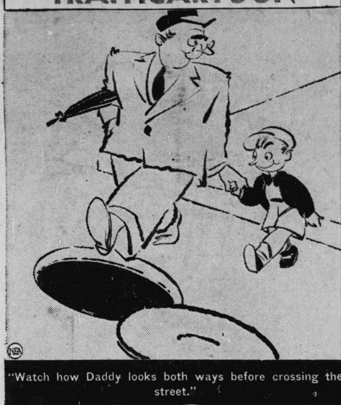
"Watch how Daddy looks both ways before crossing the street."