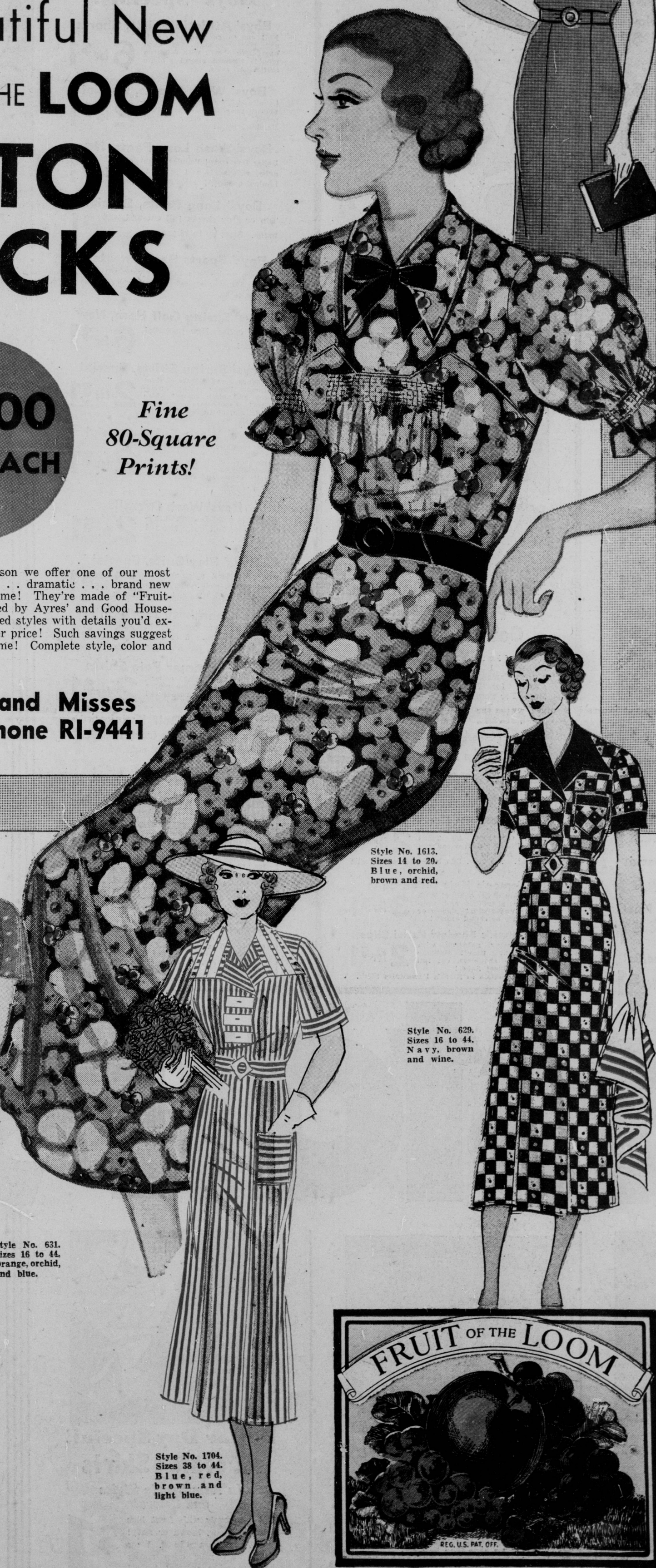
Style No. 629. Sizes 16 to 44. Navy, brown and wine.