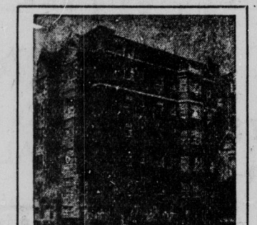
1433 N. Pennsylvania-St. Excellent location; utility and bedroom apartments; $35 to $55.

Spacious court apartment. Desirable location; 1, 2, 3 and 4 bedrooms; priced from $45 to $72.