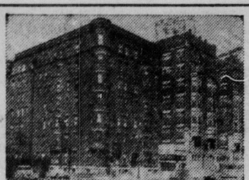
BLACHERNE (Spink Arms Annex), 402 and 410 N. Meridian. SPINK ARMS HOTEL

Ideal downtown residence; complete range of types, both unfurnished and furnished at moderate rentals.