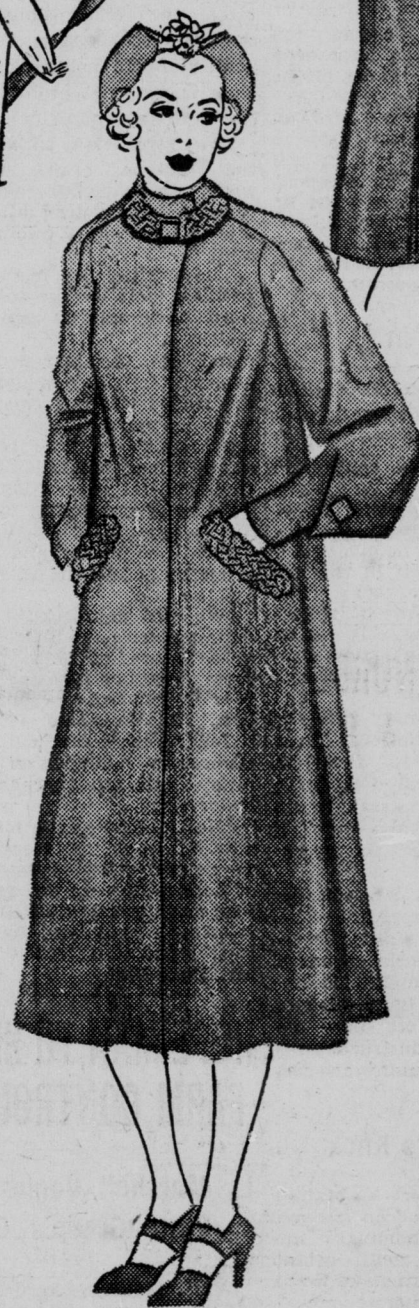
F. Play Contrast--Start With a Gray Untrimmed Coat at $13.95

Gray is one of the perfect colors for spring 1936 . . . you can use most any color scheme with it. This is extremely smart and youthful. Size 14.