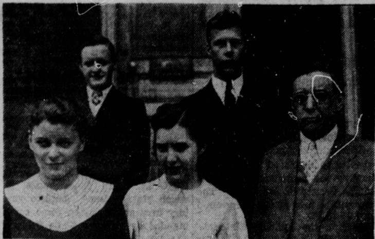
The Technical High School affirmative and negative debate teams are to debate in the state finals April 3 and 4 at Manchester College, North Manchester, Ind., on the question: Resolved that medical service should be made available to all citizens at public expense.