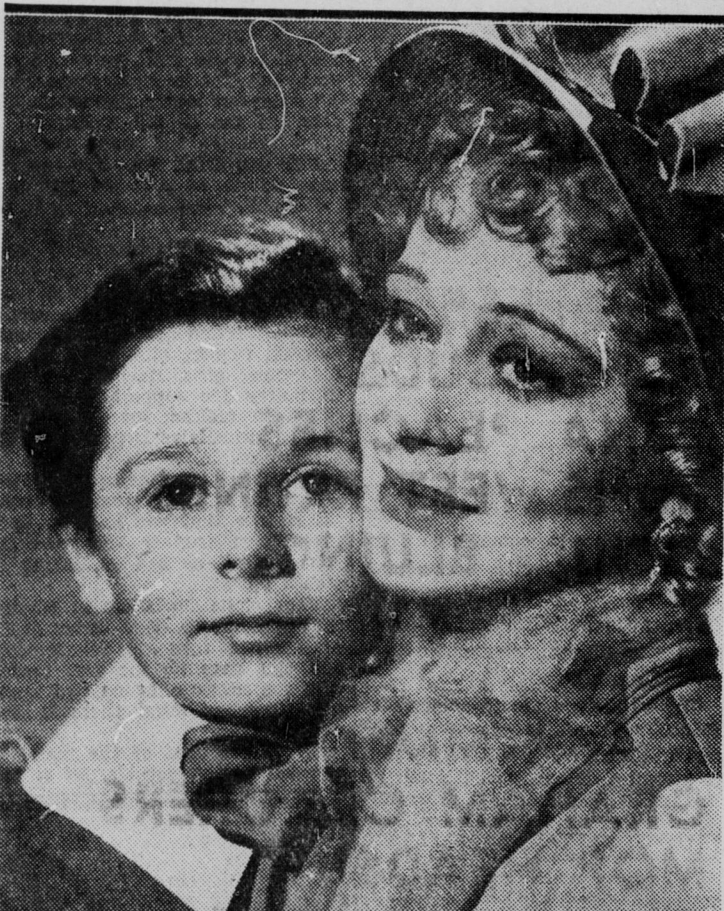
Returning to the screen in the role of Dearest, is Dolores Costello, shown with Freddie Bartholomew, star of "Little Lord Fauntleroy" at Loew's.