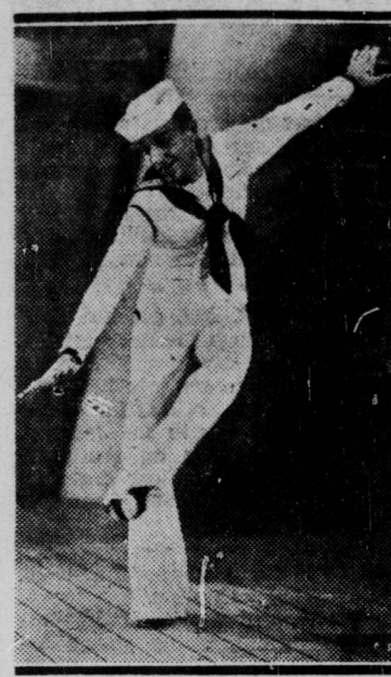
More of the famous Astaire steps are to be seen in "Follow the Fleet," in which Fred is teamed with Ginger Rogers at the Indiana.