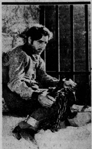
The hidden story of Dr. Mudd, imprisoned for aiding John Wilkes Booth after he had shot Lincoln, is brought to light in "The Prisoner of Shark Island," starring Warner Baxter," at the Lyric.