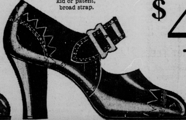
Black, brown kid or patent, broad strap.