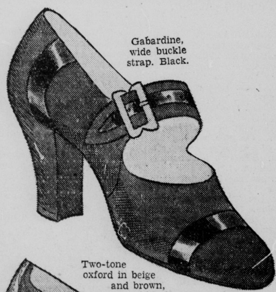
Gabardine, wide buckle strap. Black.

A navy blue print dress with detachable jacket. The blouse top is a dubonnet red shade. The small pin dots of white on the navy ground is terribly becoming. This is a size 18½. Other sizes from 16½ to 24½.