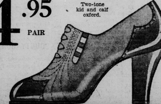
Two-tone kid and calf oxford.