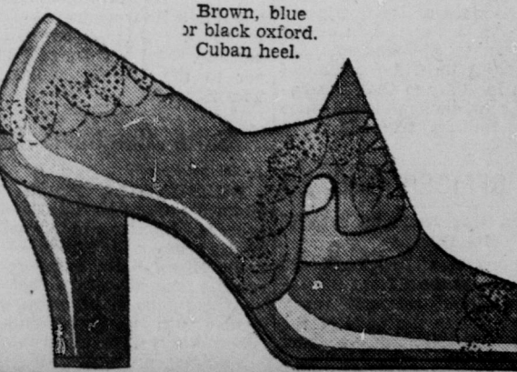
Brown, blue or black oxford. Cuban heel.

Black Brown Navy Two-Tones Black and Gray Brown and Beige Straps