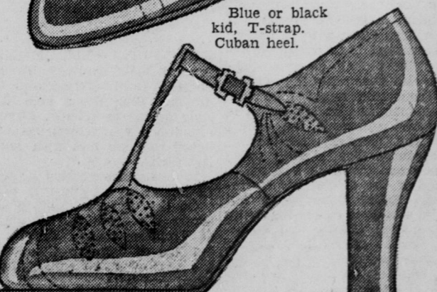
Blue or black kid, T-strap. Cuban heel.