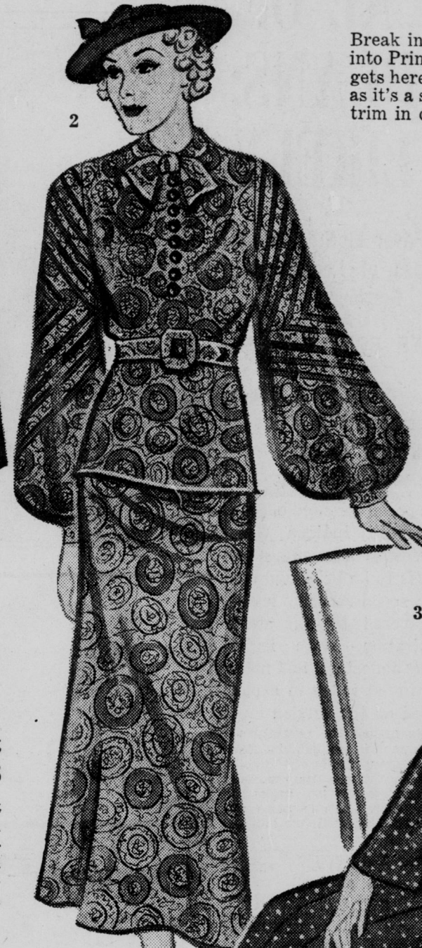
2. The Paisley Print Dress . . . . . $6.98

This smart, 2-piece print dress has a black ground with red, blue, white and green designs sprawled hither and yon. Note the clothespin buttons. Sizes 14 to 20 in the group.