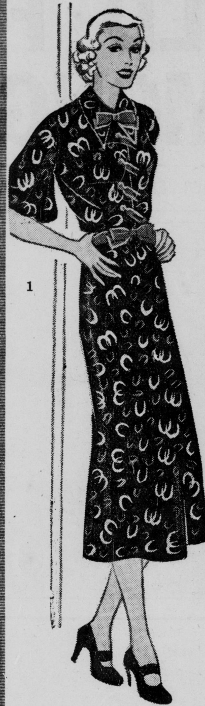
1. Two - Piece Print Dress . . . . . $3.98

Ayres' Downstairs Dress Department is ready during Fashion Week with a stunning and brilliant collection of print dresses. Complete in every style and color detail, complete in size selection for women, misses and the Junior Miss. 11 to 19, 14 to 20, 38 to 44 and 46 to 52.