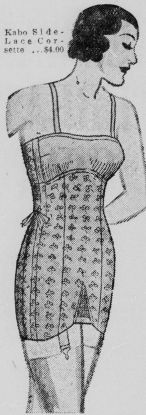
Kabo Side-Lace Corset . . . $4.00