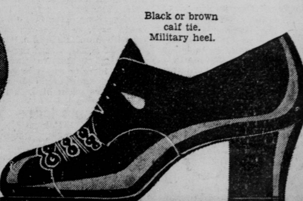
Black or brown calf tie. Military heel.