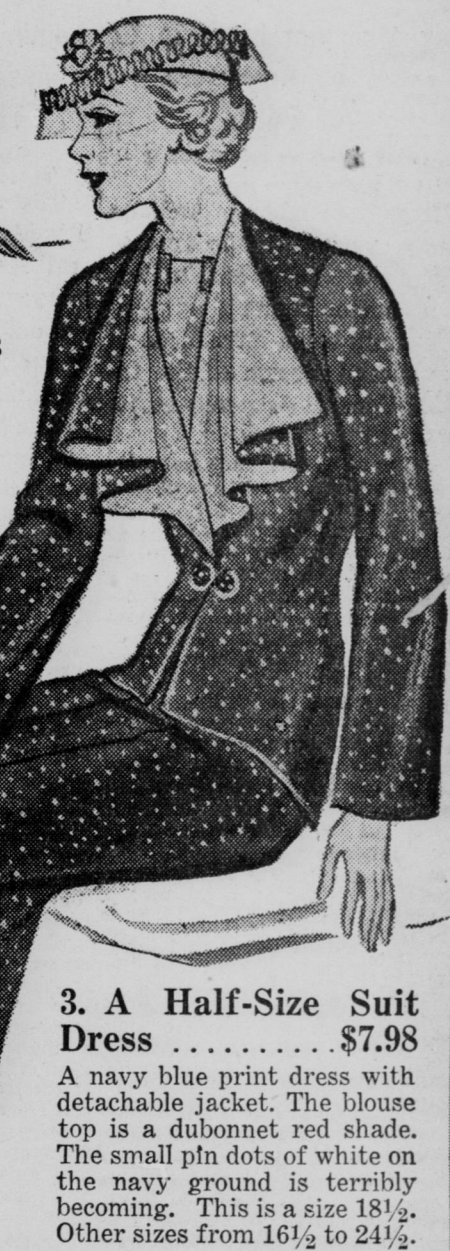
3. A Half-Size Suit Dress . . . . . $7.98

The sleeve details, the glass buttons, the tunic effect is new fashion news. The Paisley print is beautiful in design and color interest. A dream of a dress for women and misses who wear sizes 14 to 20. —Downstairs at Ayres.