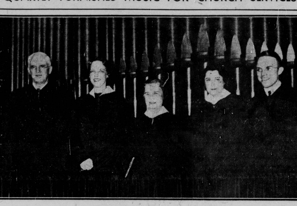
Members of the quartet who furnish music for church services.

He also is conducting a series of classes at 8 on Thursday and Friday nights.