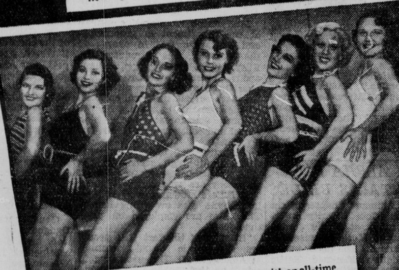
Paramount backed up the stars with an all-time beauty chorus of girls, girls and more girls. Not to mention big production number "Shanghai-dee-ho!" When we say "big show," well, the stage show was just the screen show's beginning!