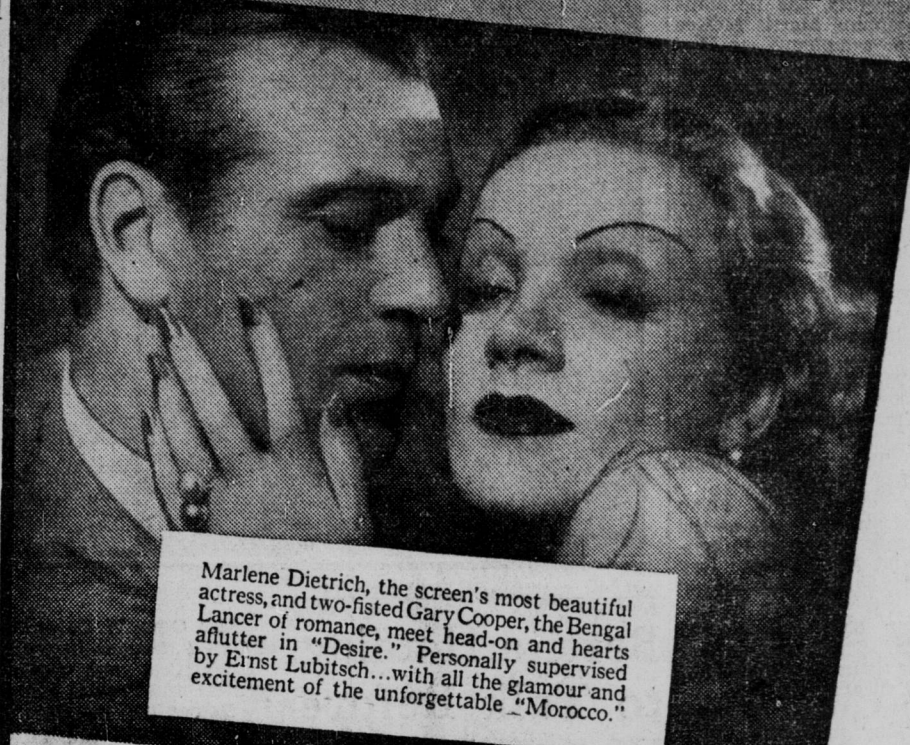
Marlene Dietrich, the screen's most beautiful actress, and two-fisted Gary Cooper, the Bengal Lancer of romance, meet head-on and hearts aflutter in "Desire." Personally supervised by Ernst Lubitsch...with all the glamour and excitement of the unforgettable "Morocco."