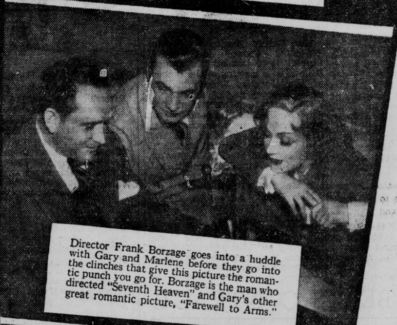
Director Frank Borzage goes into a huddle with Gary and Marlene before they go into the clinches that give this picture the romantic punch you go for. Borzage is the man who directed "Seventh Heaven" and Gary's other great romantic picture, "Farewell to Arms."