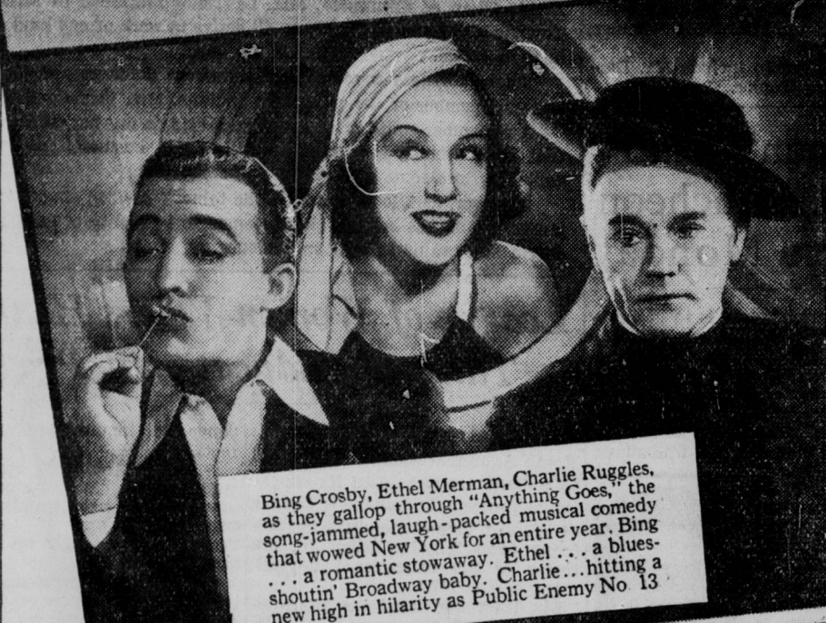
Bing Crosby, Ethel Merman, Charlie Ruggles, as they gallop through "Anything Goes," the song-jammed, laugh-packed musical comedy that wowed New York for an entire year. Bing... a blues... a romantic stowaway. Ethel... hitting a shoutin' Broadway baby. Charlie... hitting a new high in hilarity as Public Enemy No. 13.