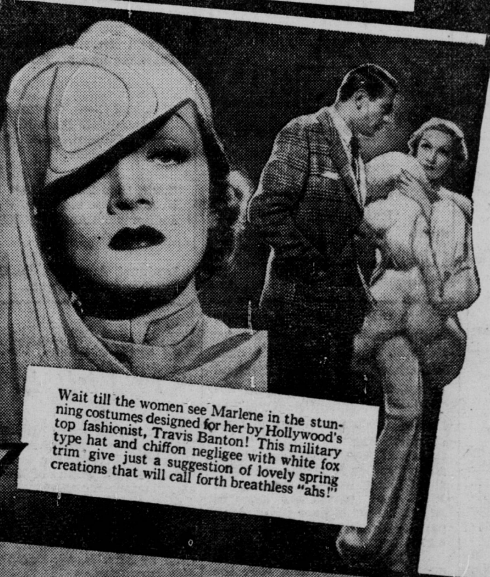
Wait till the women see Marlene in the stunning costumes designed for her by Hollywood's top fashionist, Travis Banton! This military trim give just a suggestion of lovely spring creations that will call forth breathless "ahs!"

MARLENE DIETRICH and GARY COOPER in "DESIRE" JOHN HALLIDAY ERNEST COSSART FRANK BORZAGE Director