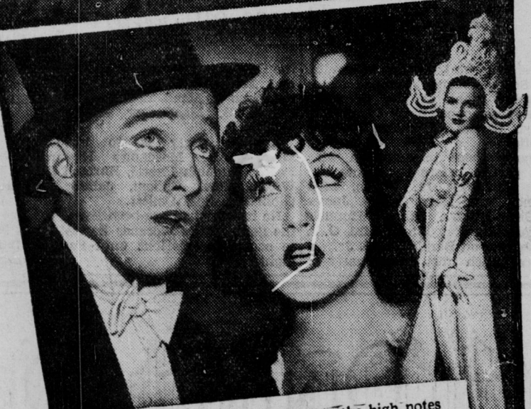
Hear Bing and Ethel wallop the high notes with those exciting Cole Porter tunes, "You're the Top," "Anything Goes," "I Get a Kick Out of You." Plus a bunch of new hits including "Sailor Beware," "Moonburn" and "My Heart and I," which you'll be whistling

"ANYTHING GOES" BING CROSBY • ETHEL MERMAN CHARLIE RUGGLES GRACE BRADLEY IDA LUPINO LEWIS MILESTONE Director