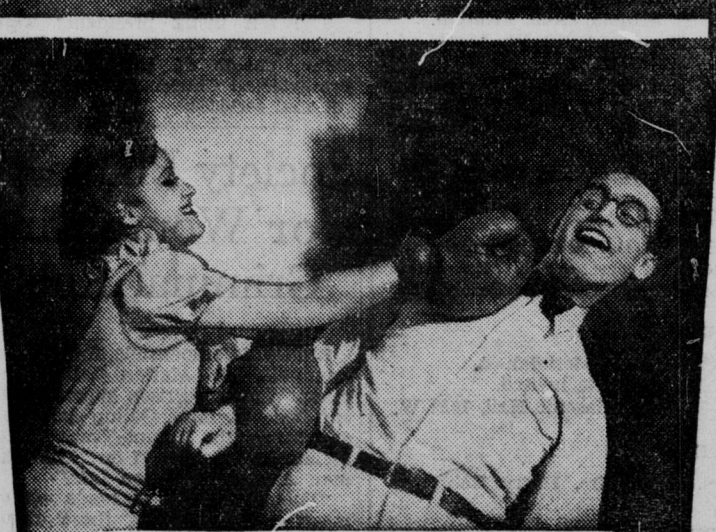
And, boy, oh boy! Harold ducks another punch... in fact he ducks his way to the championship and into your heart... but he fails to duck the Leap Year attack of pretty Dorothy Wilson. All aimed to bust your Winter blues and have you giving one long laugh for Lloyd.

HAROLD LLOYD in "THE MILKY WAY" ADOLPHE MENJOU VERREE TEASDALE HELEN MACK LEO MCCAREY Director