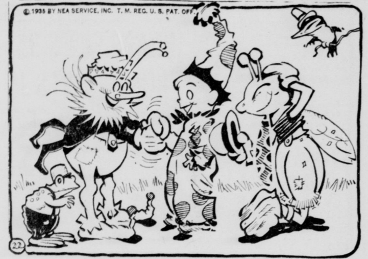
(READ THE STORY, THEN COLOR THE PICTURE)

Story by HAL COCHRAN Pictures by GEORGE SCARRO