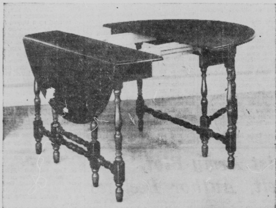
Mahogany Gate-Leg Extension Table, 48 x 54 inches, extends to 72 inches On Sale Tomorrow at $19.95

$1.00 Down—Generous Credit Terms on Balance