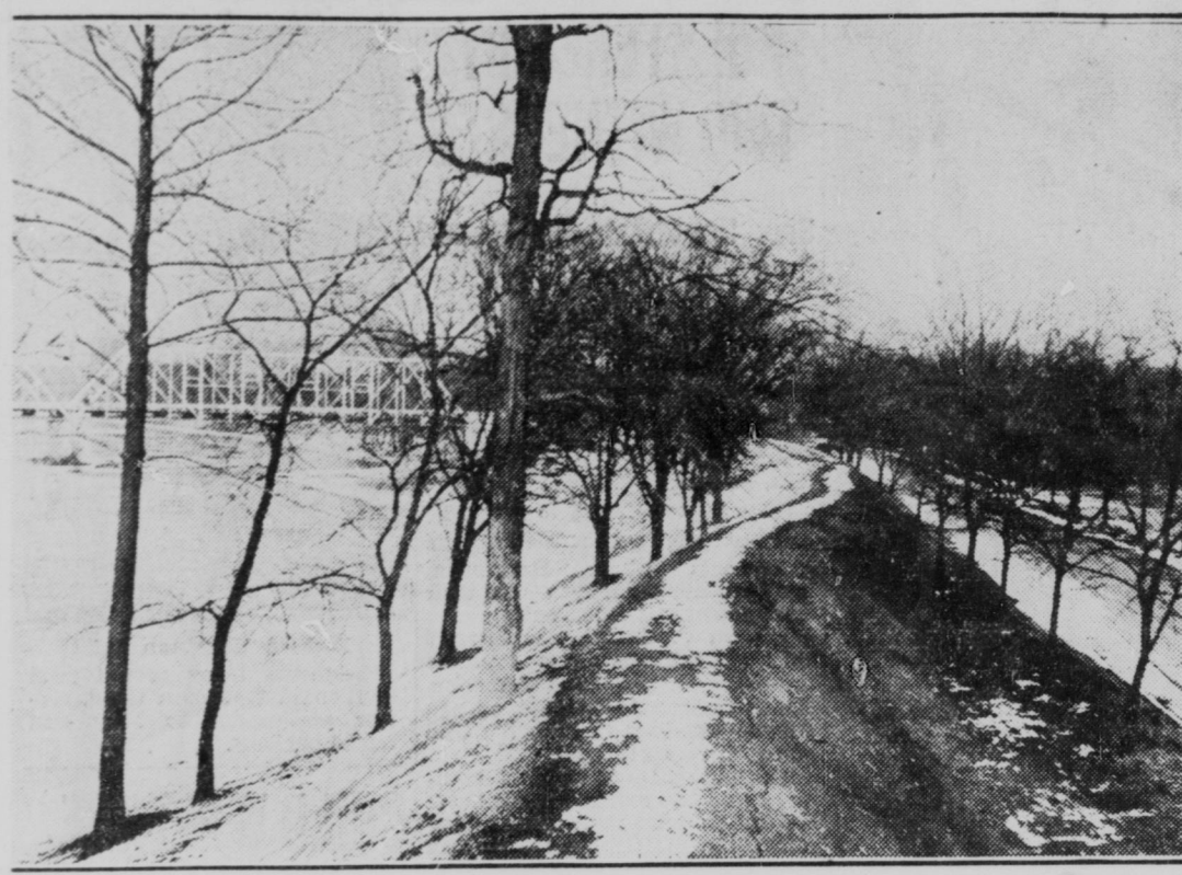
Here is the new, raised Warfleigh levee, looking north and east from the new Meridian-st bridge. The Marion County division of the Federal Emergency Relief Administration raised the levee to prevent the flooding of Warfleigh at high water. The boulevard being built atop the levee will run from Pennsylvania-st to State Road 31.