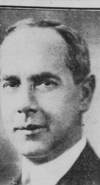
Richard Washburn Child

Pneumonia today proved fatal to Richard Washburn Child, former ambassador to Italy and famed publicist.