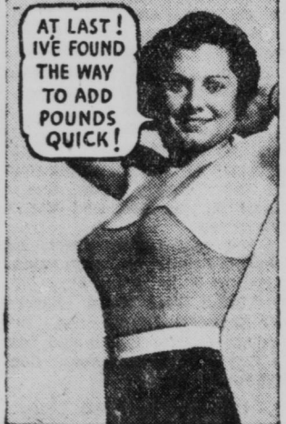
Kelpamalt costs but little at All Hook's Dependable Drug Stores.

MANUFACTURER'S NOTE—As the result of Kelpamalt's tremendous popularity, many inferior imitations—sold at high and low prices—are being advertised. Don't be fooled. Ask for the original, genuine Kelpamalt Tablets. They are easily distinguished by the green and white design on the wrapper. Absolutely guaranteed to produce results or money back.