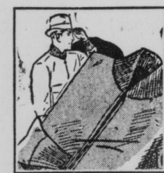
Genuine Suede Leather Jackets $3.94

For Men and Young Men Stocks have been replenished in answer to the overwhelming demand for these super values! SUITS —Single breasted! Double breasted! Sports models! Oxford grays! Smart blues! Smart browns! Smart mixtures! TOPCOATS —Belted styles! Conservative styles! Tweeds! Fleece! Twists! Plaid backs! Harris type tweeds! Many others! OVERCOATS —Even BLUE MELTONS are included! Also browns, grays and mixtures! Belted and raglan styles! BLOCK'S—Downstairs Store.