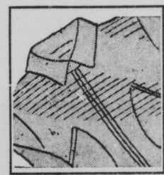
Men's Extra Heavy Melton Jackets $2.89

22-Ounce all-wool meltons; zipper front.