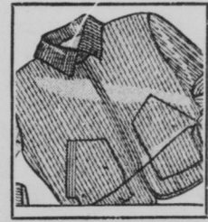
Men's Hockmeyer Corduroy Jackets $2.94

Smart plain colors or fancy patterns; sizes 28 to 30.