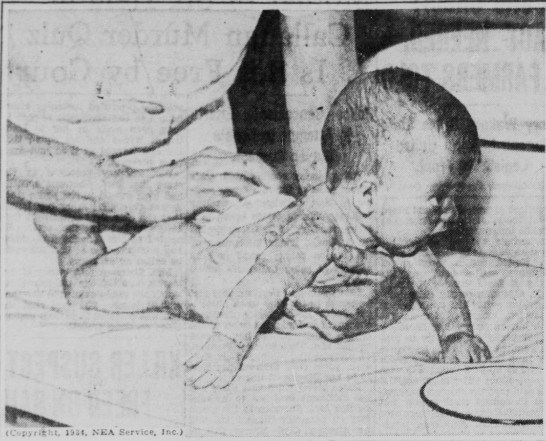
Little Annette Dionne is all exuberance, poised to go right away from there, but she won't escape from her nurse till she's been scrubbed to a rosy hue, part of the unfailing routine through which the quintuplets go every day in their hospital-home in Corbell, Ont. Annette can be pardoned for bubbling with joy, for the other day she tipped the scales at 11 pounds 2 1/2 ounces to pass Yvonne, long the heaviest of the babies, in the quintuplets' weight race.

HEAVIEST DIONNE NOW; ALL IN LATHER OVER IT