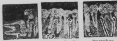
Impaction Abscess Cavity Pyorrhea