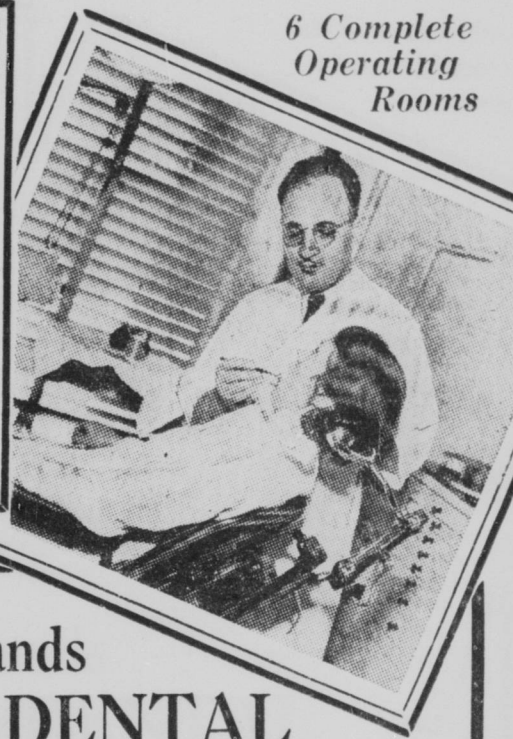
6 Complete Operating Rooms

Complete Equipment to Give Complete Service!