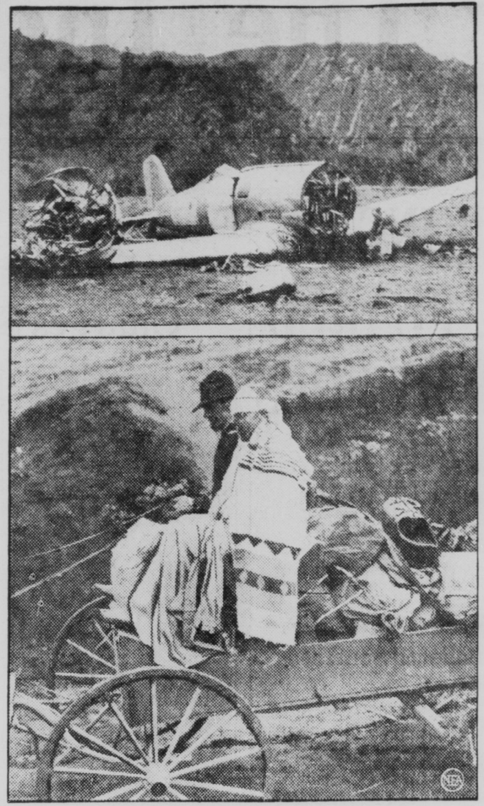
A plane crashes, the pilot is injured, but the mail goes on. The upper picture shows the shattered mail plane piloted by George Rice, veteran TWA flyer, which was wrecked in the California wilds on Oak mountain, twelve miles northwest of Newhall. Below, the injured flyer, wrapped in a blanket, resumes his journey on a farmer's wagon, the precious mail cargo heaped behind him.