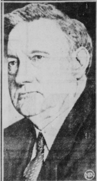
James E. Watson