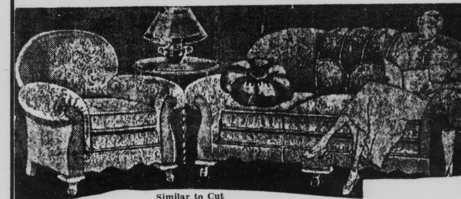
Similar to Cut

Your Money Back, If You Can Buy This Suite Elsewhere for Less