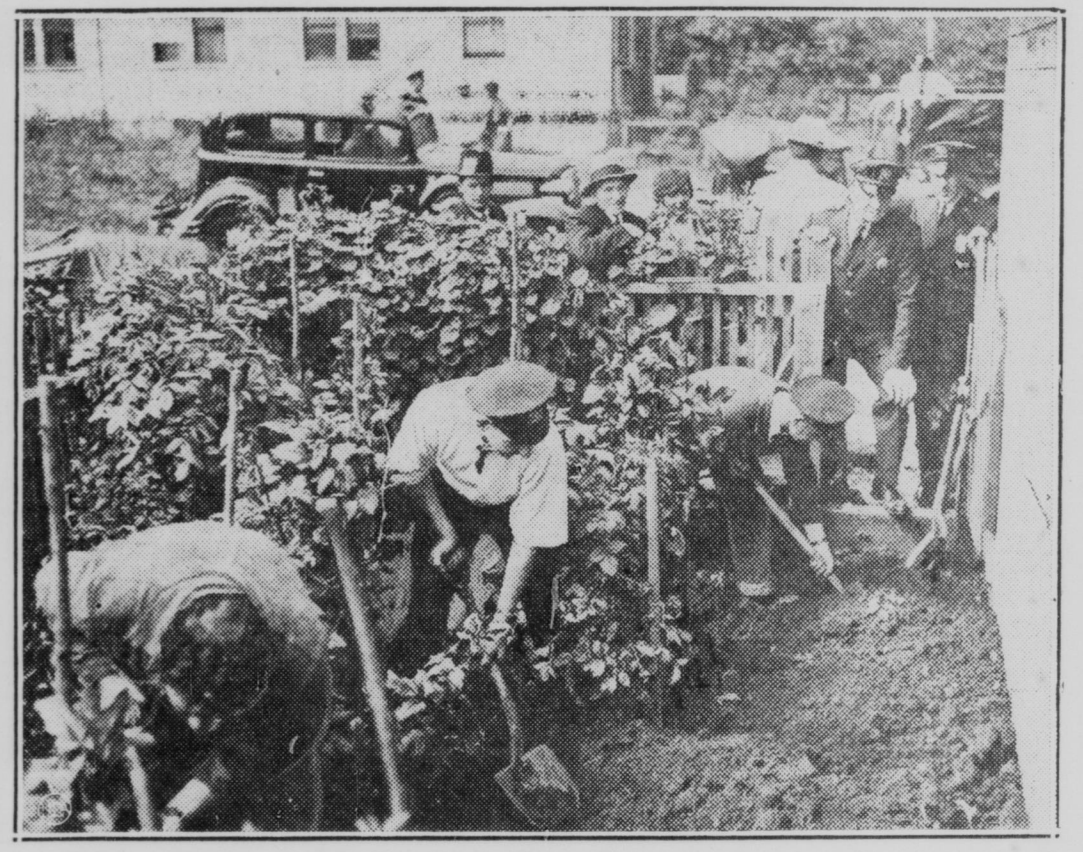
Waging an intensive hunt for the remainder of the Lindbergh ransom money, officers are shown as they dug furiously in the garden of Bruno Richard Hauptmann, kidnap suspect, after discovering $13,750 buried in the prisoner's garage.

FEDERAL RESERVE BANK OF NEW YORK CASH DEPARTMENT