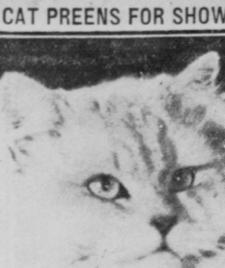
CAT PREENS FOR SHOW