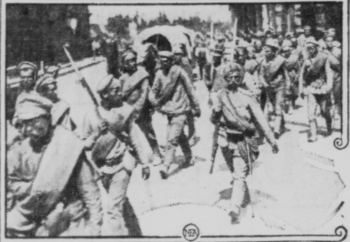
Soldiers of Czarist Russia on the march.

Russia 'Mobilizes Partially'—in Secret; British Fleet Is Held Concentrated