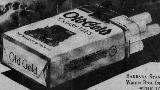
BARBARA STANWYCK starring in Warner Bros. forthcoming picture ... "THE LOST LADY"