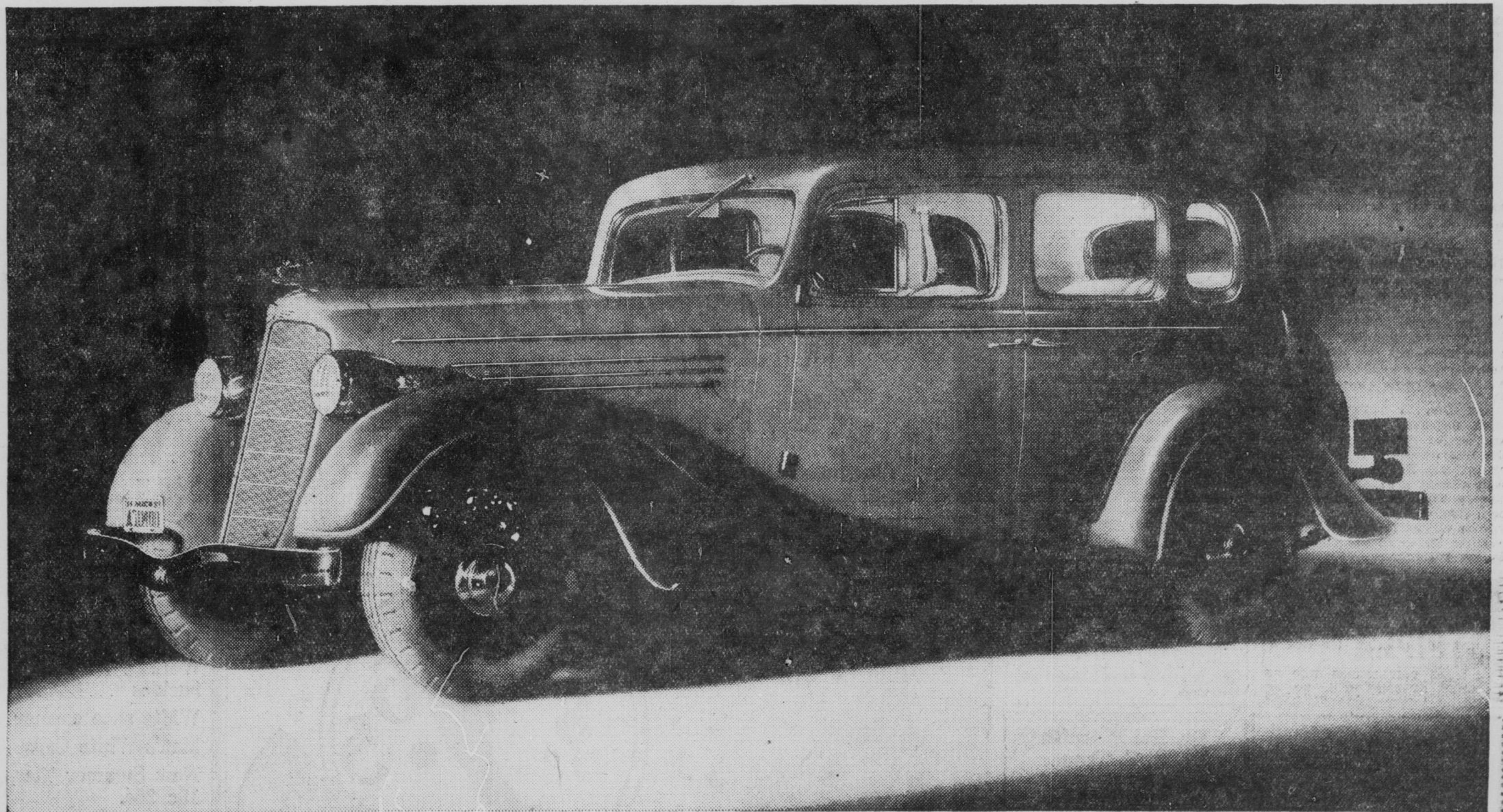
Body by Fisher

93 horsepower—85 miles an hour—15 miles per gallon ... a BUICK Through and Through