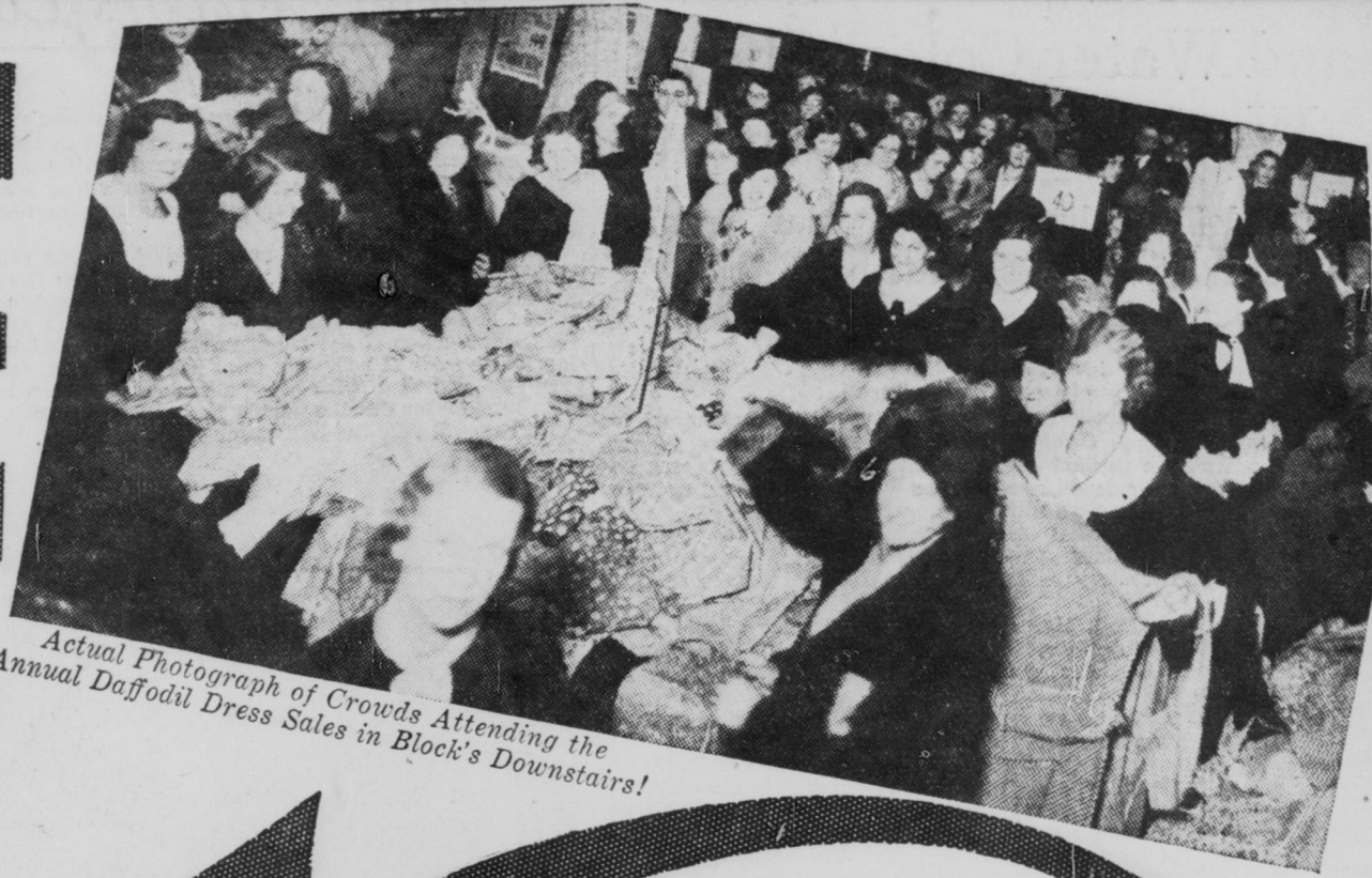
Actual Photograph of Crowds Attending the Annual Daffodil Dress Sales in Block's Downstairs!

Get A NEW DRESS IF YOURS FADES from Equalled at This Low Price!