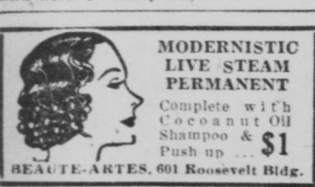
MODERNISTIC LIVE STEAM PERMANENT